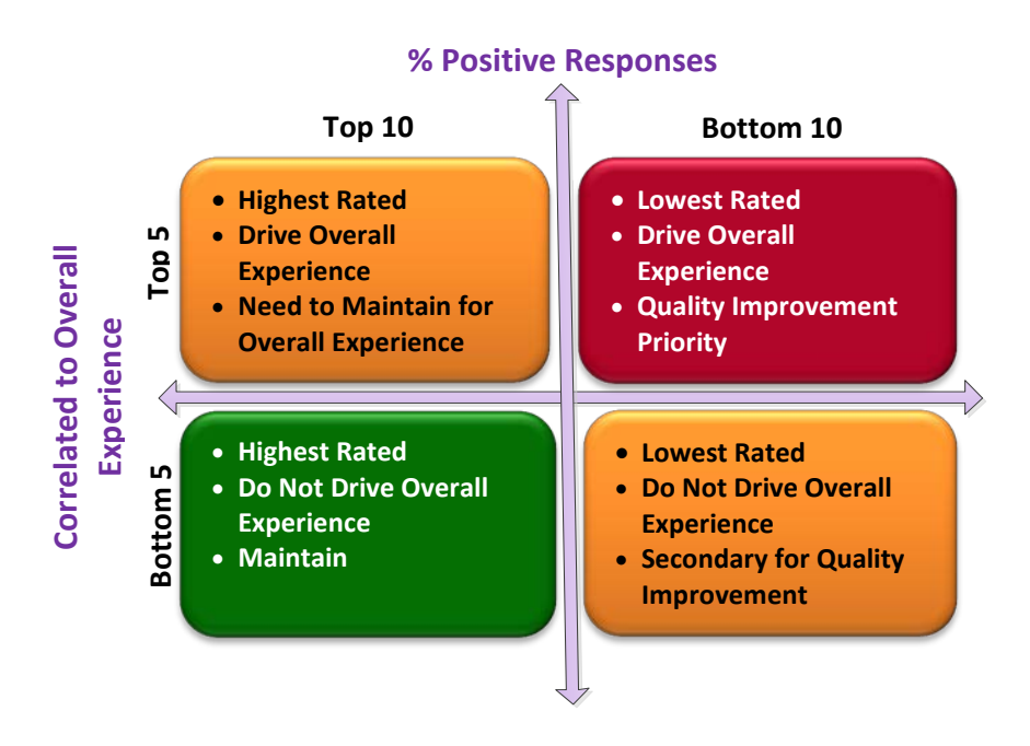
Figure 1. Groupings of % Positive Responses with Correlations to Identify Priorities

In order to identify the potential priority areas for improving the overall experience, the 10 items with the highest positive responses and 10 items with the lowest positive responses (and the top and bottom 5 items correlated to overall experience) were grouped as shown in Figure 1. Based on this approach, a priority area for improvement for outpatients is item # 10 I receive clear information about my medication (i.e. side effects, purpose, etc.) in the Services Provided Domain. For inpatients, a priority target for improvement efforts is item # 9 Staff helped me identify where to get support after I finished the program/treatment in the Discharge or Finishing the Program/Treatment domain. Both priority items identified for quality improvement are areas in that fall into our bottom positive responses, yet are highly correlated with the overall patient experience.