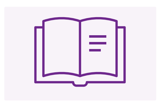
Click the icon to read our study paper

The digital mental health tools or resources are not meant as an alternative or replacement to in-person or clinical mental health treatment, but they can instead be used to help you in managing / maintaining your mental wellness.